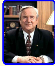
Dr. Jerry Falwell