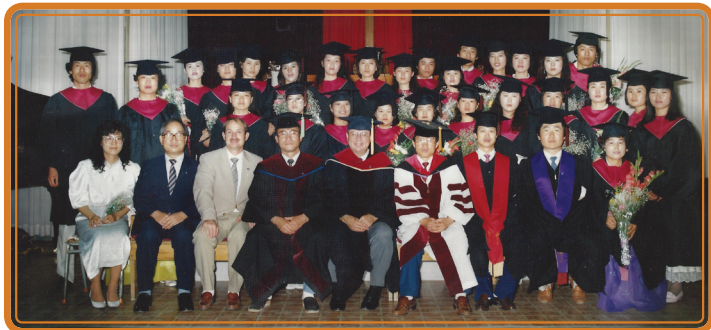
GRADUATION EXERCISES KOREA-AMERICAN INTERNATIONAL BIBLE SEMINARY (June 8, 1988)

Currently, we have branches of our ministry in Southern Africa : Botswana (2.1M), Namibia (2.2M), Zambia (14.2M), Mozambique (24.1M), South Africa (48.6M), Swaziland (1.4M), Lesotho (1.9M) and in East/Central Africa : Tanzania (8.3M), Kenya (44M), Uganda (34.8M), Rwanda (12M), Burundi (10.9M), Democratic Republic of the Congo (75.5M), South Sudan (11.1M), and Somalia (10.3M). The combined population of the nations covered by the two branches is 301.4M. There is much spiritual darkness covering this area. Already, several million have been touched with the establishment