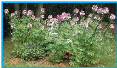
CLEOMES IN BACK YARD