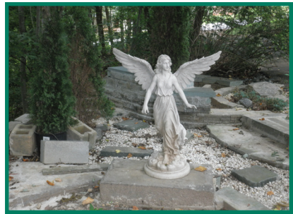
ROCK GARDEN AT HENRYS

The name of the Lord stands for the Lord Himself. The Lord is a place of refuge and protection for those who trust in Him. Therefore, in a moment of great need or fierce temptation, call upon the name of the Lord, and He will help you and keep you from sinning. We can count on Him. We don't have to be defeated.