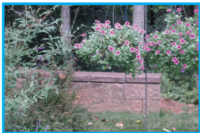
PETUNIAS-BUTTERFLY BUSH AT BACK WALL