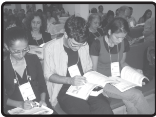
Intensity in listening/note taking