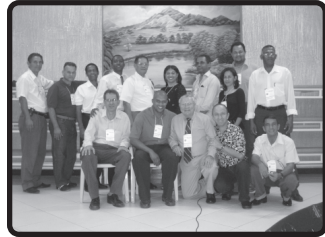
Forty-nine pastors participated

The beautiful facilities include an auditorium to seat 500 and ample educational space. The church has a school, pre-school through seventh grade, with 509 students enrolled. The church has fifteen pastors including a ministry in the worst prison in Rio de Janerio. "We had nothing plus God."