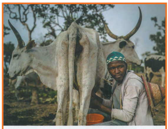
Militant Islamic factions among ethnic Fulani herdsmen carry out attacks on Christi villages, serving as foot soldiers for extremist groups like Boko Haram and al-Qaida

It was in the late 80s that I became acquainted with the Islamist Fulani herdsmen, a nomadic tribe that is spread across West Africa. At that time I was an avid jogger. One morning, after my devotions, I jogged in the area around the compound where I was staying. As I ran out in an open area, I sensed that I was not running along. When I looked around, there were a group of boys and girls running behind me. These were the children of the Fulani tribe living in their tents in that area. I made it a point to interact with them with smiles