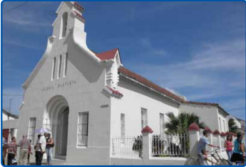
Beautiful First Baptist Church, Placetas, Cuba Unchanged from January 1960--Looks the same!