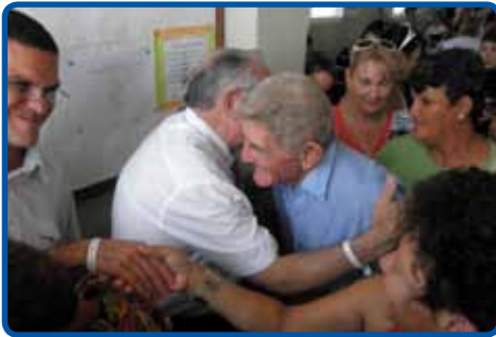
Plenty of hugs