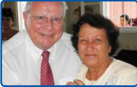
Saved in 1960-Led house church that is now a Baptist church.