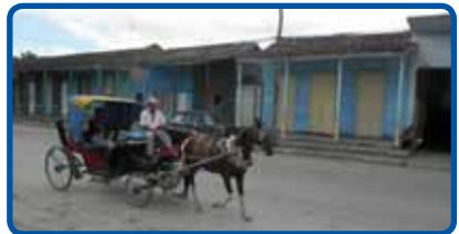
Same horse & buggy transport