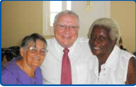
Two of the 70 saved in 1960