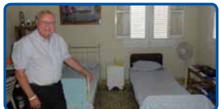
Sleeping in same bedroom