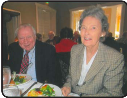
CELEBRATING SIXTY-ONE YEARS