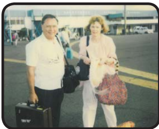
ARRIVING IN VENEZUELA JULY 20, 1992