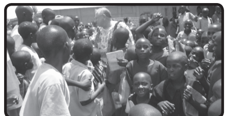
4,007 PLUS HUNDREDS OF CHILDREN