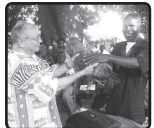
PRESENTATION TRADITIONAL CONGO GIFT A ROOSTER