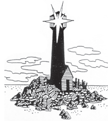
A LAMP TO MY FEET

(5) Plead that the pastors of this nation will not compromise the truth of worldly fame or finances ( 2 Corinthians 4:5 ).