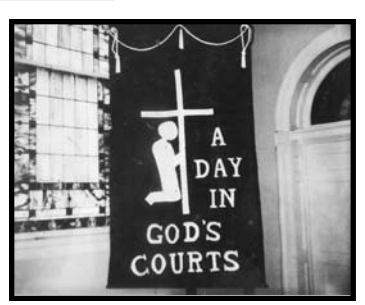
Banner at Montezuma (GA) United Methodist Church Seminar

The theme of the prayer seminar ministry has always been "A Day in God's Courts" ( Psalm 84:10 ). In contemporary America, few Christians can say that they have spent a day in God's courts. Neither can they say that anyone has ever asked them to do so. The world is too much with us to take time to be holy.