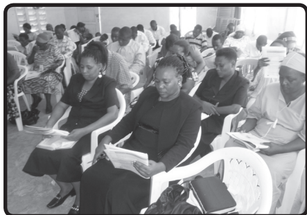
Class in Tanzania

Our basic focus was on teaching pastors (192) and leaders the purpose and power of prayer. Although the seminars were set up for Christians, forty-three (including one pastor’s seventeen-year old son) came to Christ; the Holy Spirit did a great work in bringing conviction to both the saved and the unsaved) as He brought the Word alive and instructed us. As usual, the workbook (this time Swahili edition) was greatly appreciated