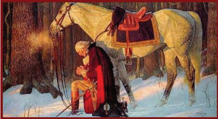
Washington at Valley Forge

VOL.62, No.2 "Holding Forth the Word of Life" February 2016