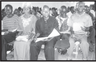
A Blessed Day Democratic Republic of the Congo--2007

"In everything give thanks!" is the instruction of Paul to the church at Thessalonica ( 1 Thess 5:18 ). Thanksgiving will not change God, but it changes us. Good advice is to TRY THANKSGIVING in your problems.