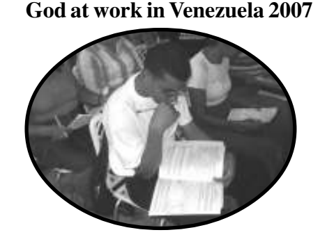
Mark your prayer calendars for 2008: March 15-30

Preparing copy is a highlight of each month's activities. We want to be a blessing in your life and this is a tangible way for us to do so. By reading and heeding, you, then, will be a blessing in my life. If you know anyone whom you feel would benefit from the Reflector , get their permission and share their mailing address with us. As we draw nearer to the years when travel will be limited, we can continue to serve actively through the printed ministry.