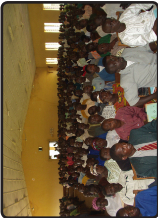
NIGERIA-THE MOST FRUITFUL NATION FOR THE PRAYER SEMINAR MINISTRY RETURN DECEMBER 3-21

Reflector ISSN 0885-8538 J. Gordon Henry Ministries 1127 Lakeview Drive Lynchburg, Virginia 24502-2807 (434) 239-8837 \E-mail:jghm84@aol.com www.jgordonhenryministries.org