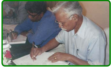
HUNDREDS IN PAKISTAN STUDY URDU PRAYER SEMINAR WORKBOOK