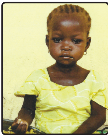
SURVIVING BOKO HARAM A child rescued from Islamist militants by Nigerian soldiers in Sambia Forest.