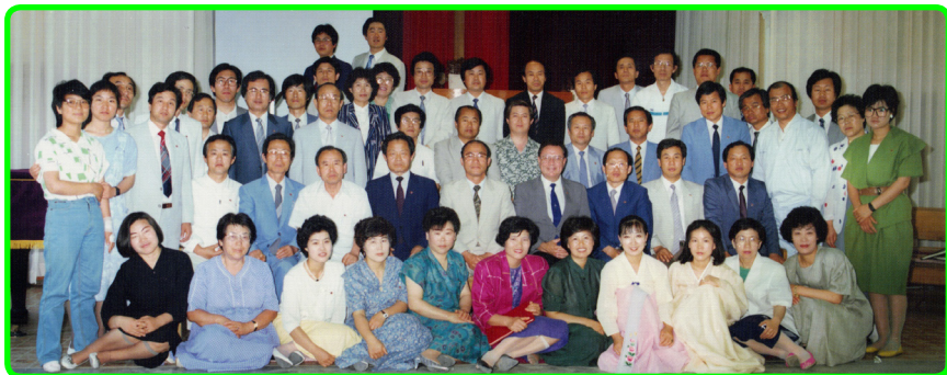
Pastors/Leaders from 27 cities/towns/villages throughout South Korea

JGHM does have some "archives" that highlight the international ministry. For example, we have thousands of pictures. In the "Polaroid" era, my goal was to snap a minimum of one hundred photos during each trip. When we shifted to a digital camera, we have often gone beyond one hundred shots. Further, we have small artifacts from each nation that we have served. But above all else, we have a written record. There is a section