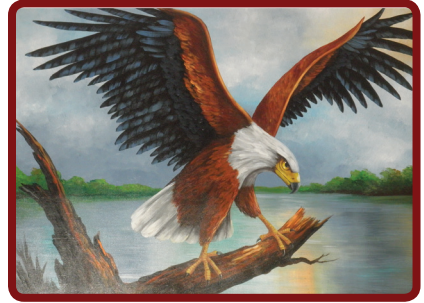
"WAIT" PROMISE (ISAIAH 40:31)

On several occasions during the recent prayer seminars in South Africa, I was deeply moved by the spontaneous expressions of praise and worship when we were singing and praying. Some brothers and sisters walked about with