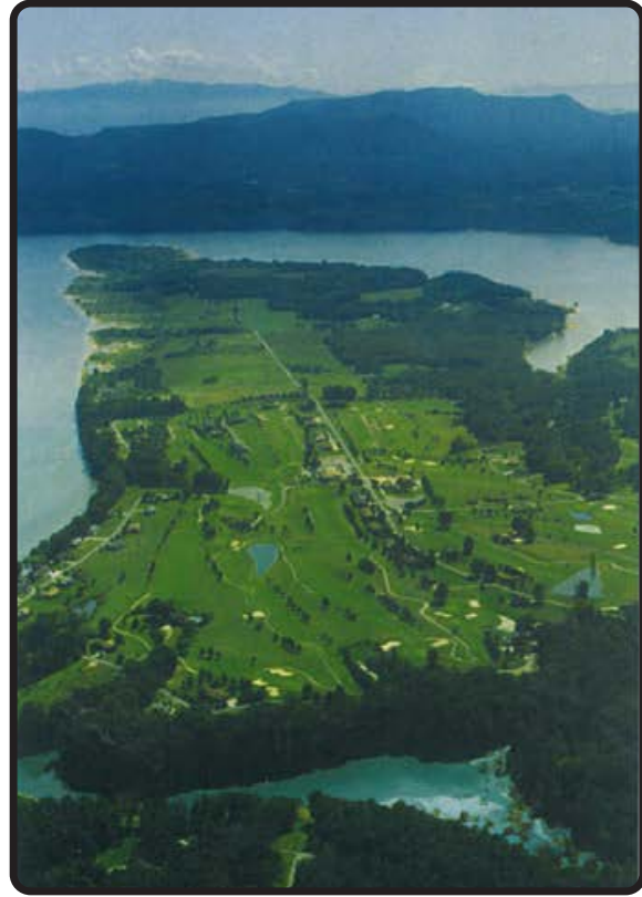
In the East Tennessee Foothills of the Great Smoky Mountains