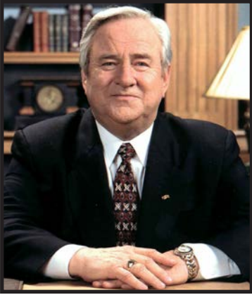
DR. JERRY FALWELL (1933-2007)

"What do you say to these things?" is a question that has come from a number of our friends who know our involvement in the foundational years of Liberty University, Lynchburg, Virginia. I served as the first provost (first called "academic dean", then "Vice President for Academic Affairs"). The time period of my active involvement was 1972 until 1980, the last two years as a consultant overseeing moving from candidacy to accreditation with the Southern Association of Christian Colleges and Schools (SACS).