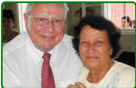
Saved in 1960 led house church that became 2nd Baptist Church