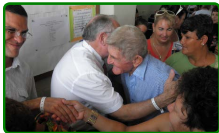
PLENTY OF HUGS IN CUBA

In choosing a challenge to guide us each day during the rest of our earthly pilgrimage, I know of no better statement than "Walk with the King today and be a blessing!"