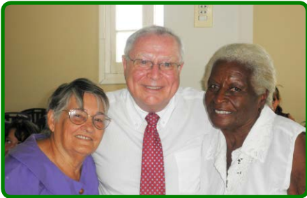
Two of 70 saved in 1960