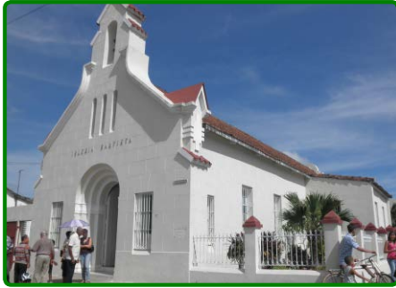
Beautiful First Baptist Church Placetas, Cuba