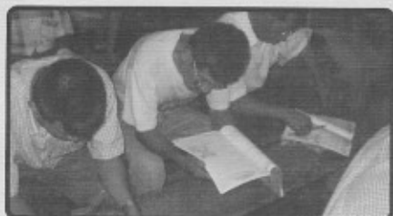
EXCELLENT NOTE TAKERS

You cared! You gave! You prayed! God gave the increase! From the time I left Lynchburg on May 31, until I arrived home on June 16, the presence of the Lord was evident step by step. The response of the Peruvians paralleled the interest that we have experienced in other Latin American countries. Included in those attending were many pastors who were eager to understand the truths taught with the intention of teaching them to their own people.