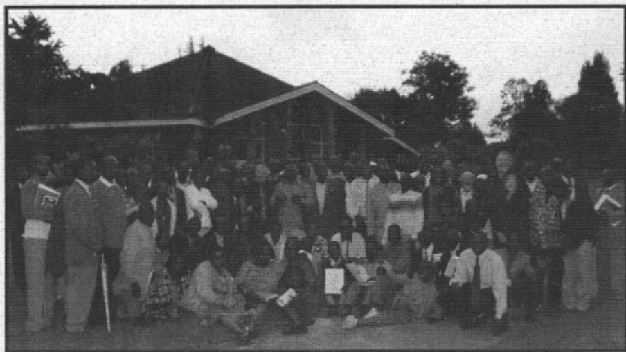
130 Prayer Seminar Workbooks Used with Pastors

A wonderful week in Kenya teaching pastors in the East Africa Bible Institute