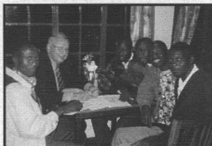
PLANNING FOR SEMINARS IN WESTERN KENYA/THE CONGO November-December 2006